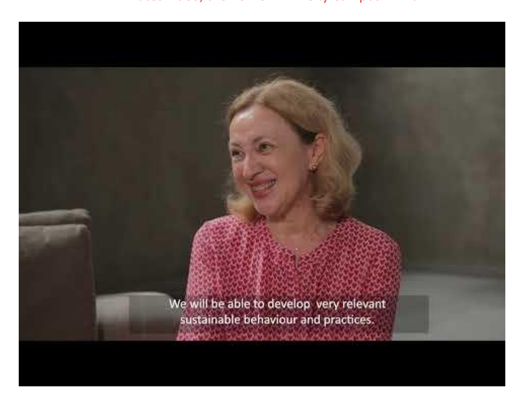
In 2 minutes video, the new SKEMA City Campus in Brazil:

It will open its doors to the school's staff in July and will welcome Brazilian and international SKEMA students at the end of August for the start of the 2021 academic year.